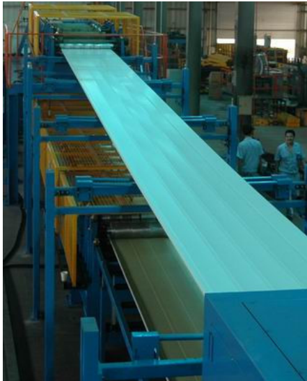
Plate Preheating Furnace

The forming machine system consists of an upper forming machine, a lower forming machine, a pressing machine platform placed on the upper pressing machine, and an upper and lower interface track connecting the forming machine with the preheating furnace.